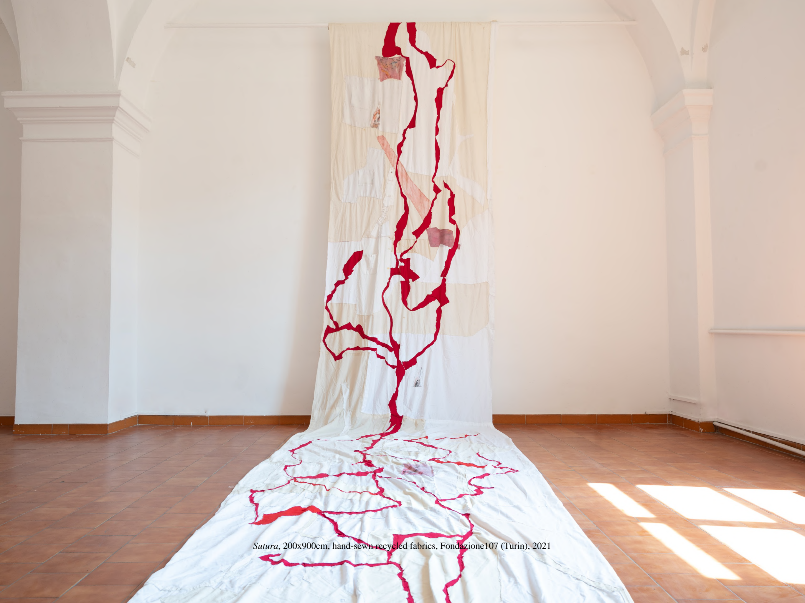
Sutura , 200x900cm, hand-sewn recycled fabrics, Fondazione107 (Turin), 2021