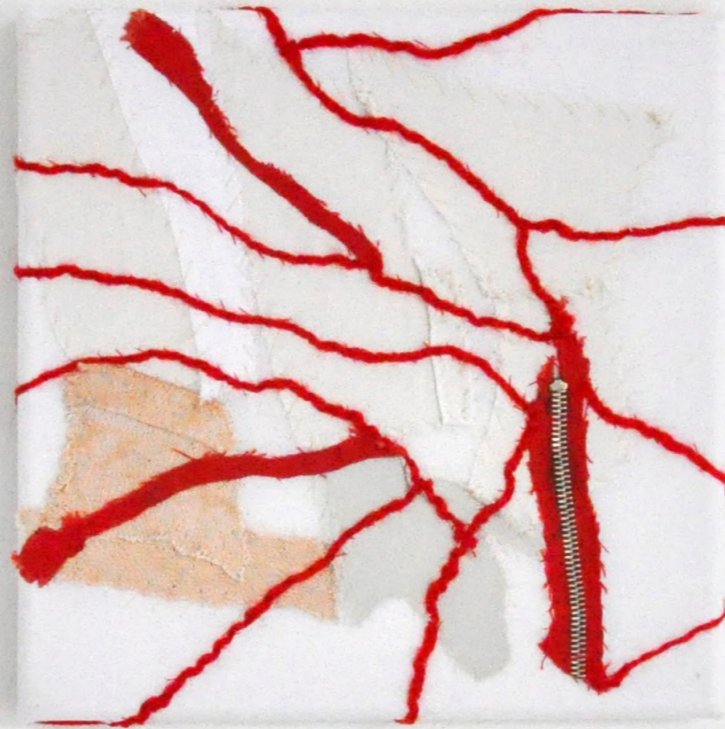
Sutura , 20x20cm, hand-sewn recycled fabrics, Culterim gallery (Berlin), 2023