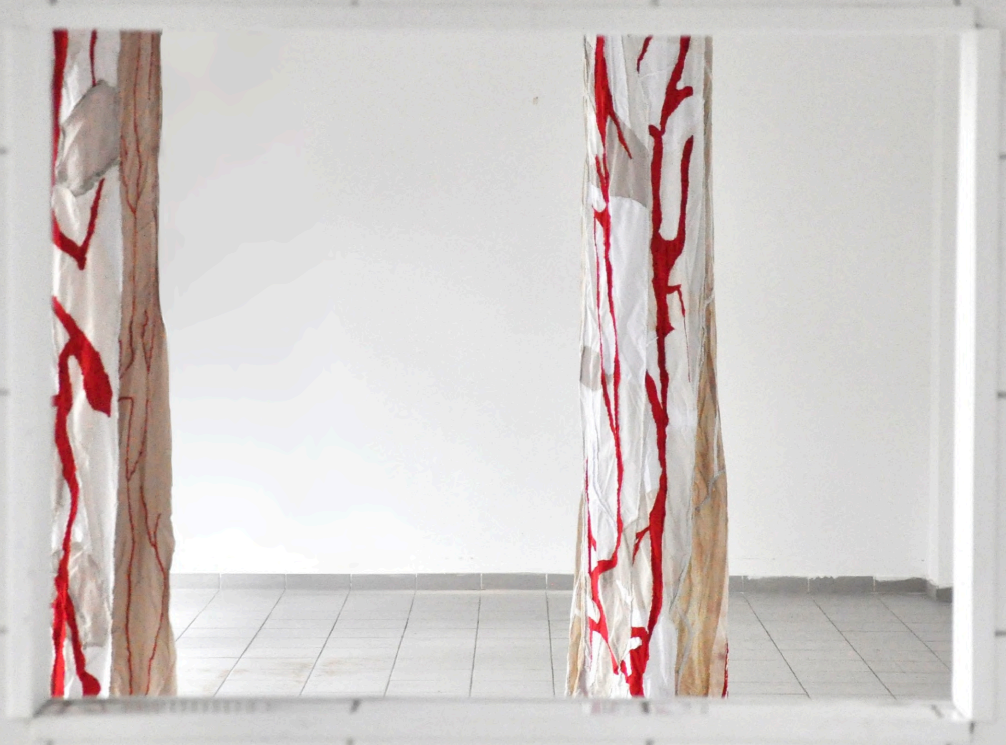
Sutura , 400x60cm, hand-sewn recycled fabrics, Culterim gallery (Berlin), 2023