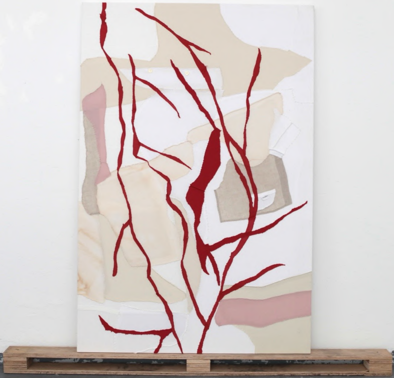
Sutura , 100x150cm, hand-sewn recycled fabrics, Atelier Antoine Quai 1er (Monte-Carlo), 2024