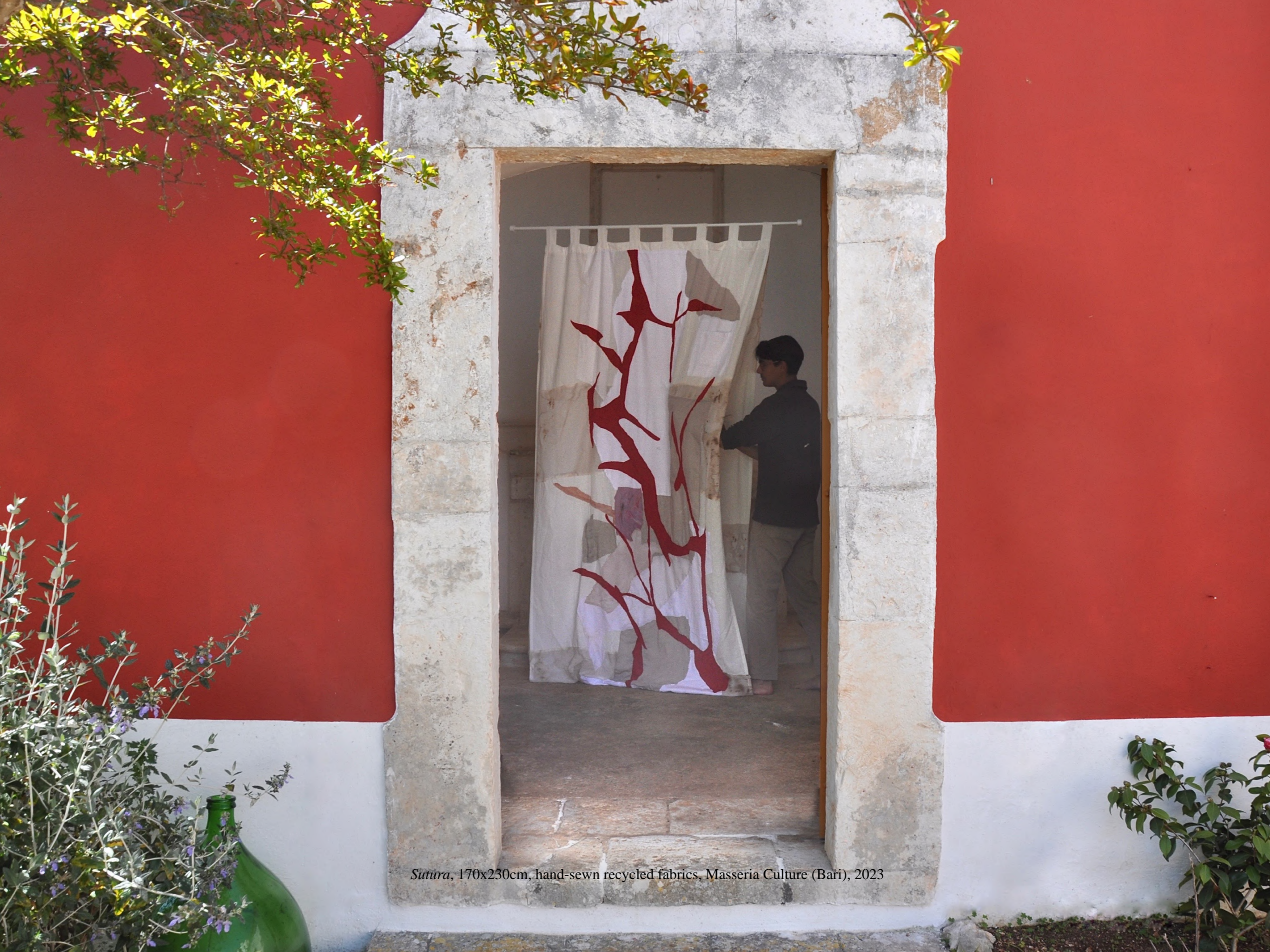
Sutura , 170x230cm, hand-sewn recycled fabrics, Masseria Culture (Bari), 2023