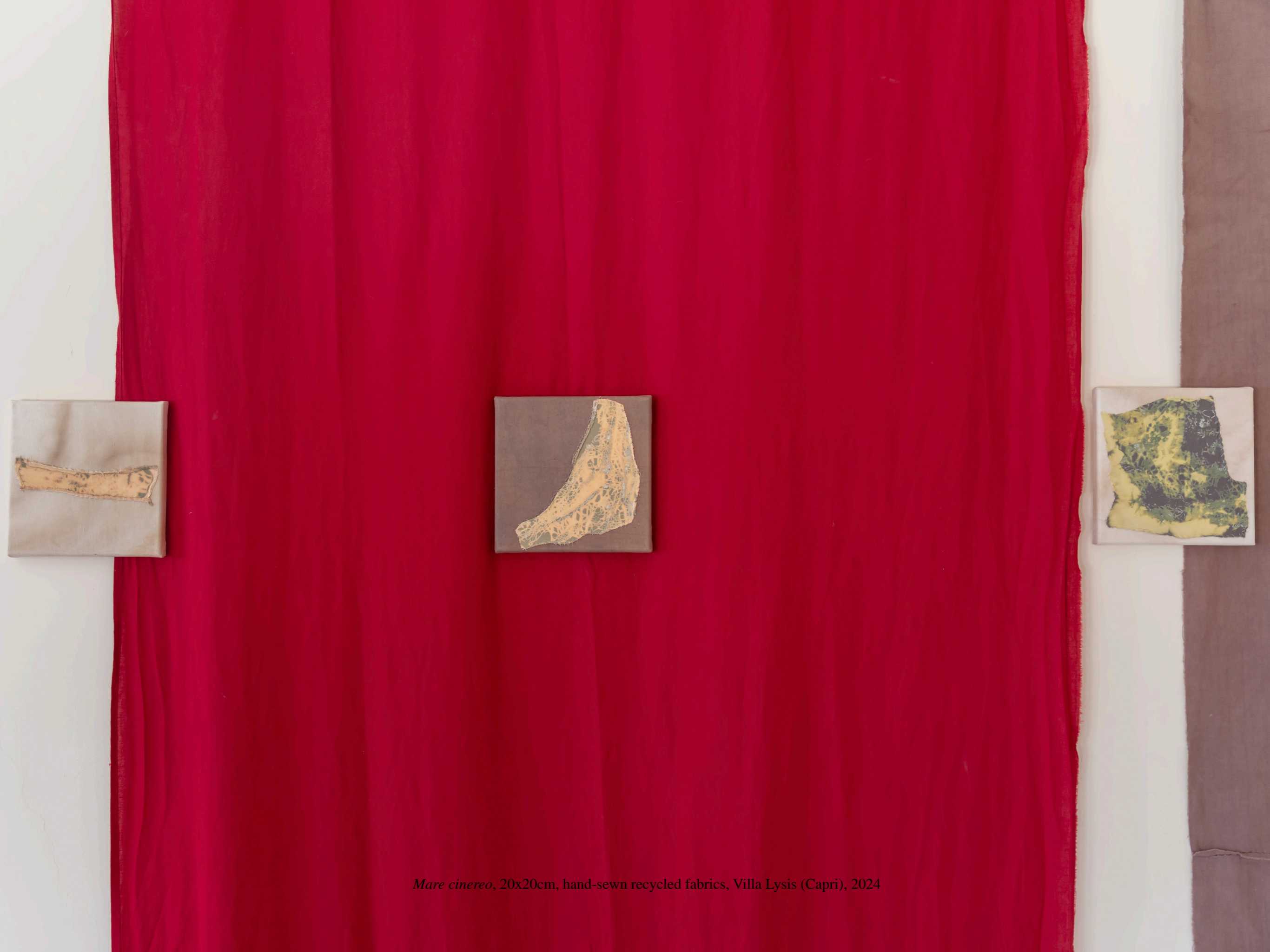
Mare cinereo , 20x20cm, hand-sewn recycled fabrics, Villa Lysis (Capri), 2024