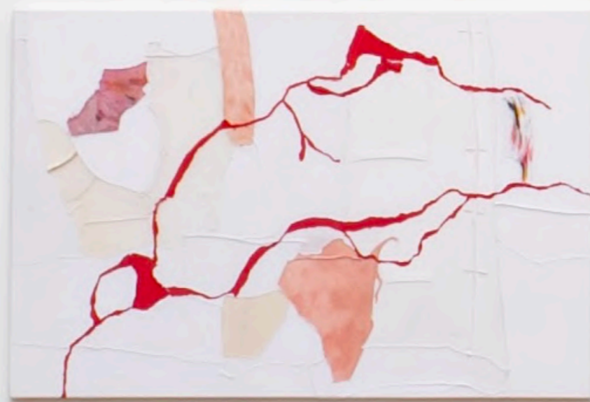
Sutura , 100x150cm, hand-sewn recycled fabrics, Palazzo Strozzi (Florence), 2021