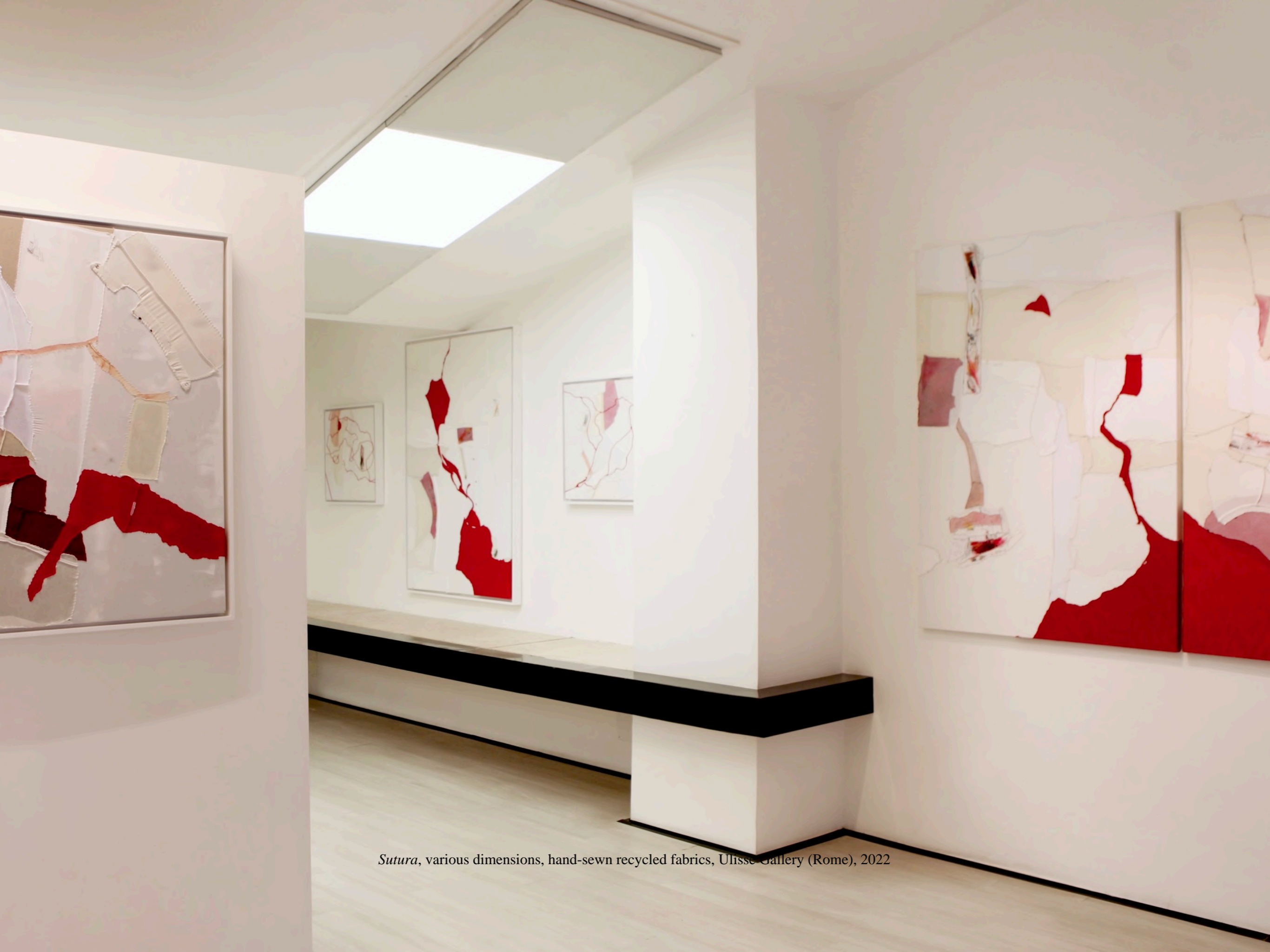
Sutura , various dimensions, hand-sewn recycled fabrics, Ulisse Gallery (Rome), 2022