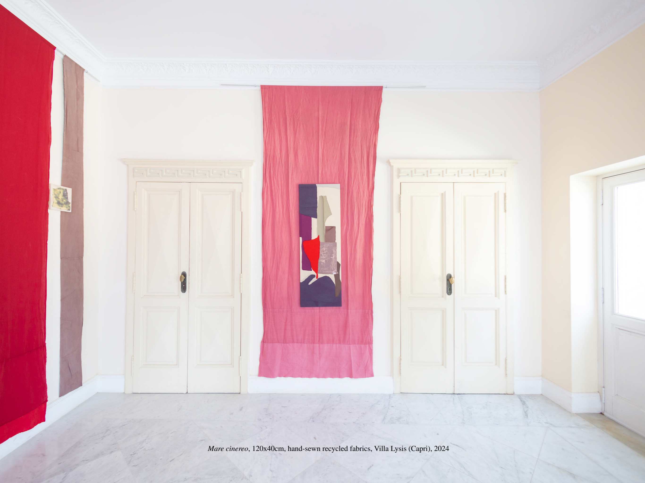
Mare cinereo , 120x40cm, hand-sewn recycled fabrics, Villa Lysis (Capri), 2024