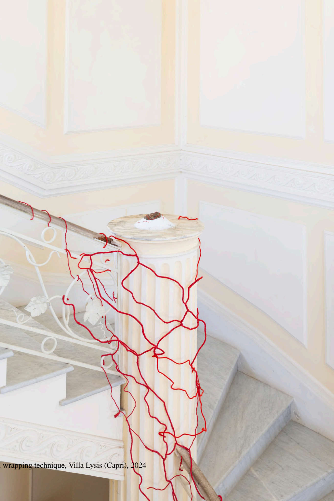
Di mare e il suo orlo , site specific installations, wrapping technique, Villa Lysis (Capri), 2024