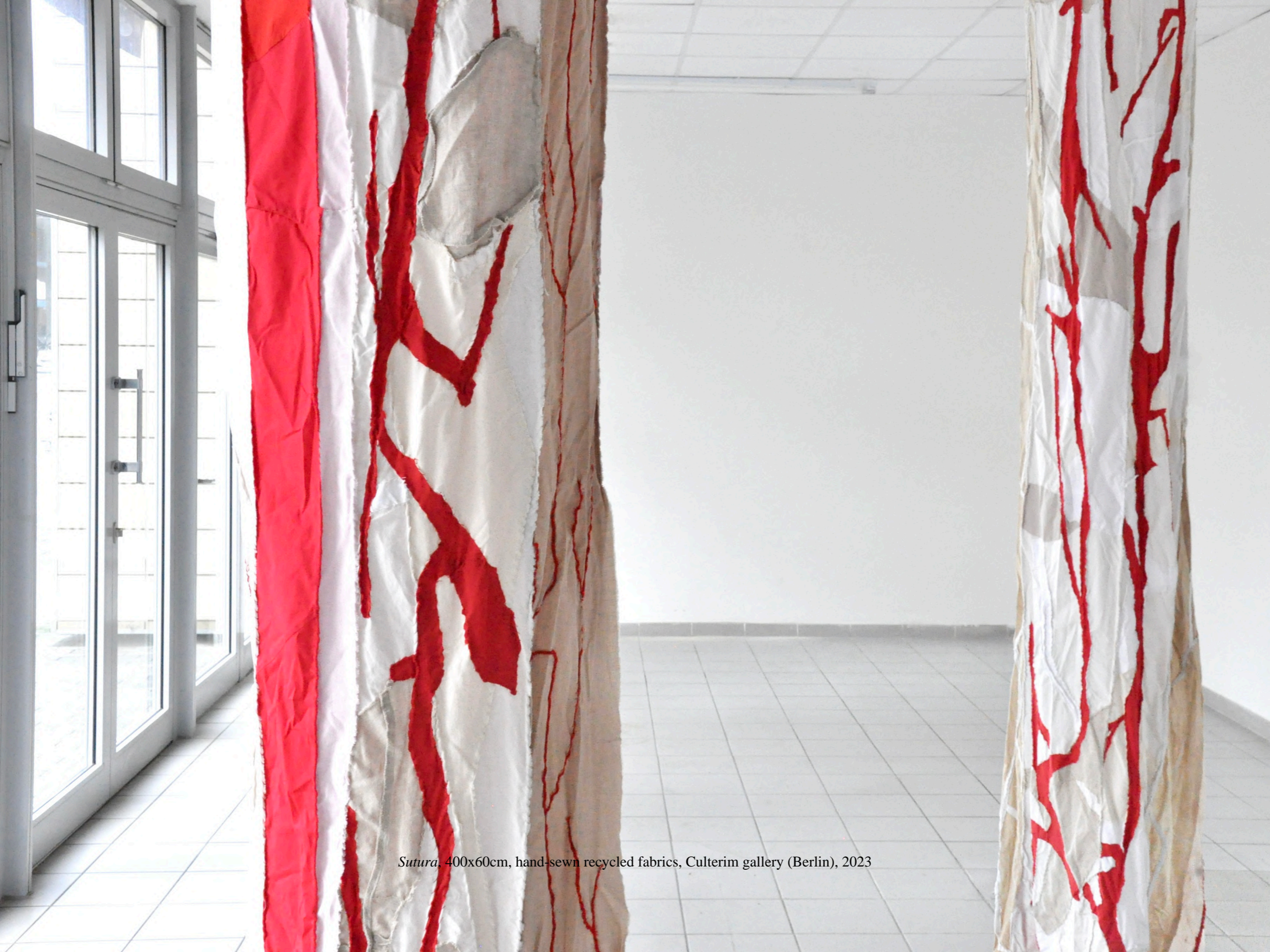
Sutura , 400x60cm, hand-sewn recycled fabrics, Culterim gallery (Berlin), 2023