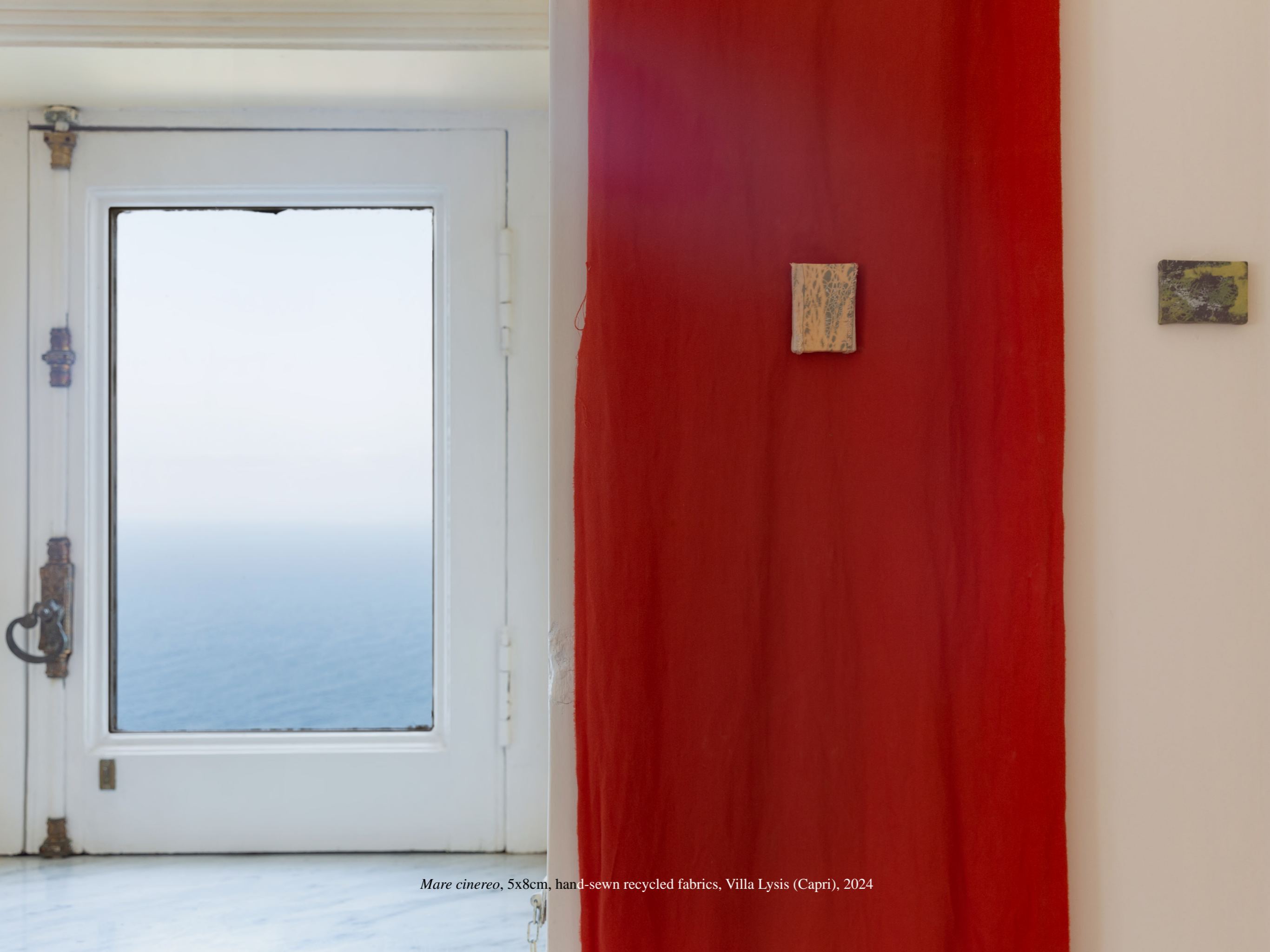
Mare cinereo , 5x8cm, hand-sewn recycled fabrics, Villa Lysis (Capri), 2024