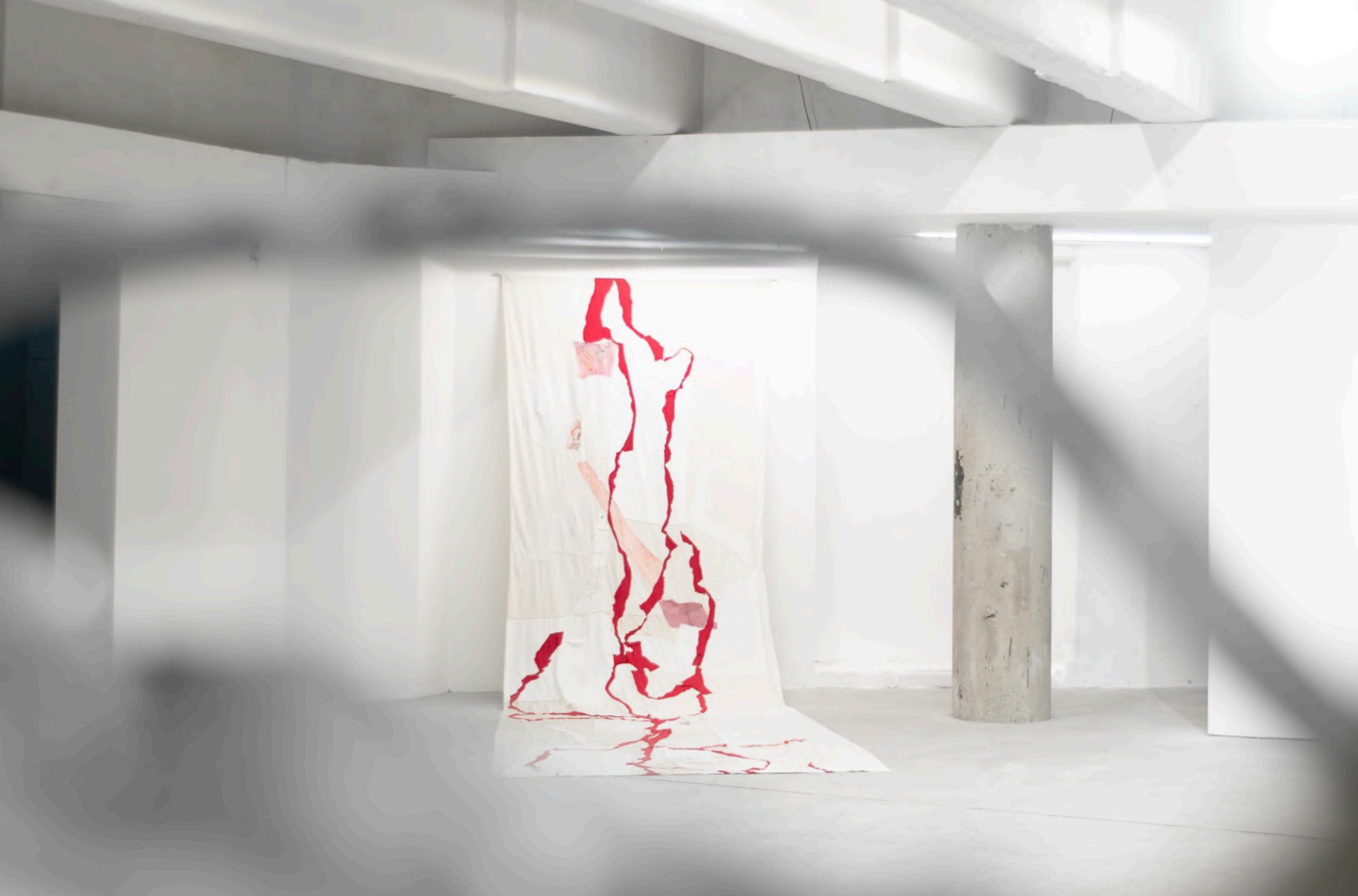
Sutura, 155x500cm, hand-sewn recycled fabrics, Nicola Del Roscio Foundation (Rome), 2024