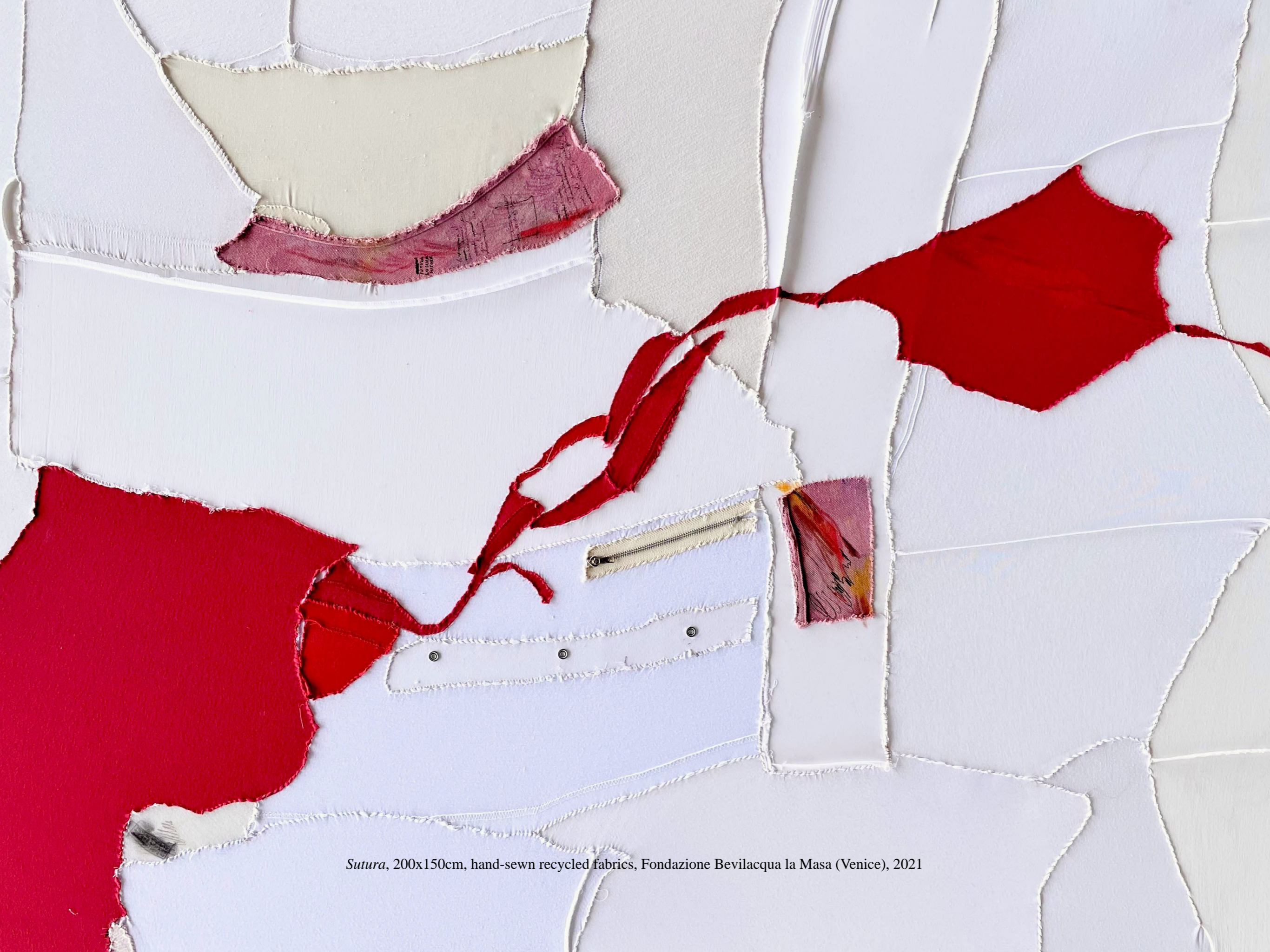
Sutura , 200x150cm, hand-sewn recycled fabrics, Fondazione Bevilacqua la Masa (Venice), 2021