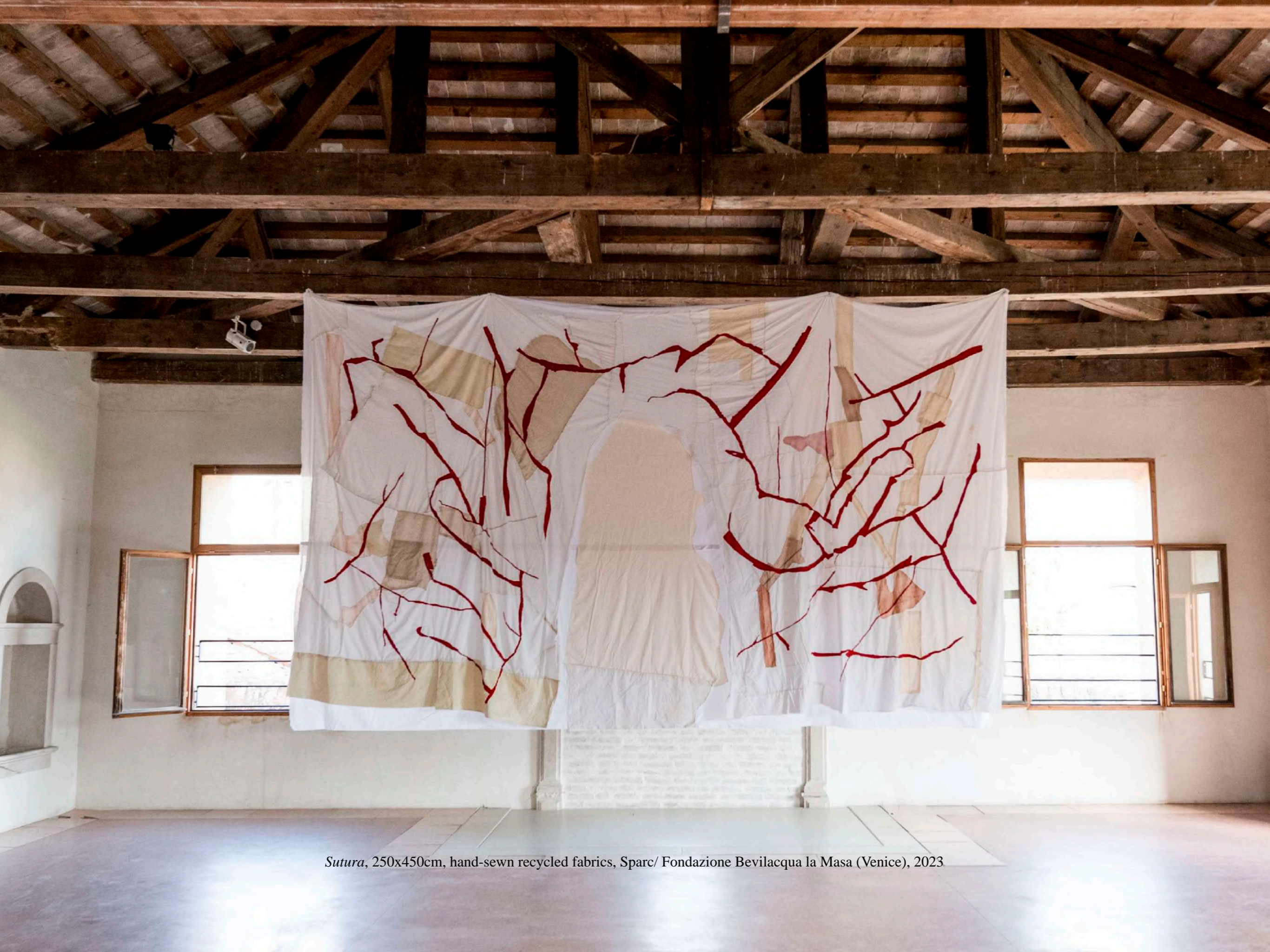
Sutura , 250x450cm, hand-sewn recycled fabrics, Sparc/ Fondazione Bevilacqua la Masa (Venice), 2023