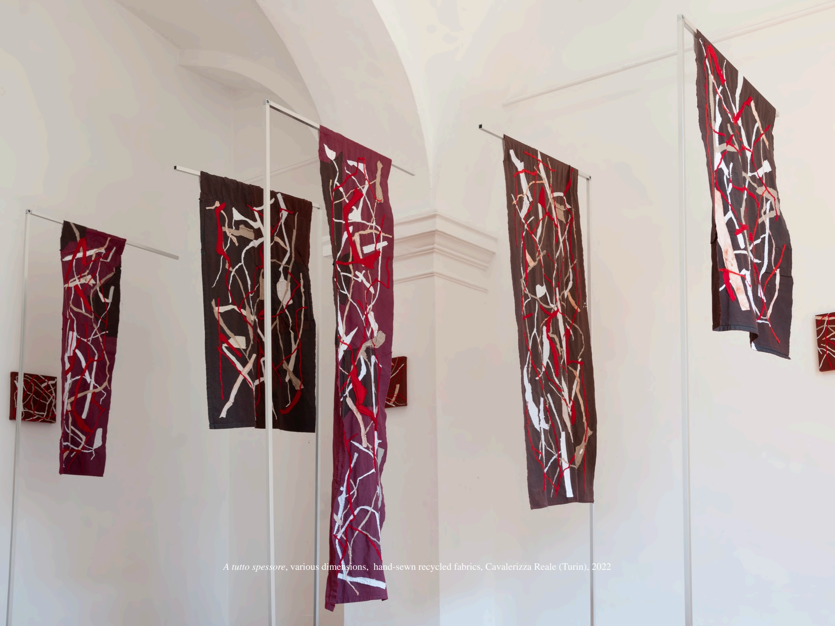
A tutto spessore , various dimensions, hand-sewn recycled fabrics, Cavalerizza Reale (Turin), 2022