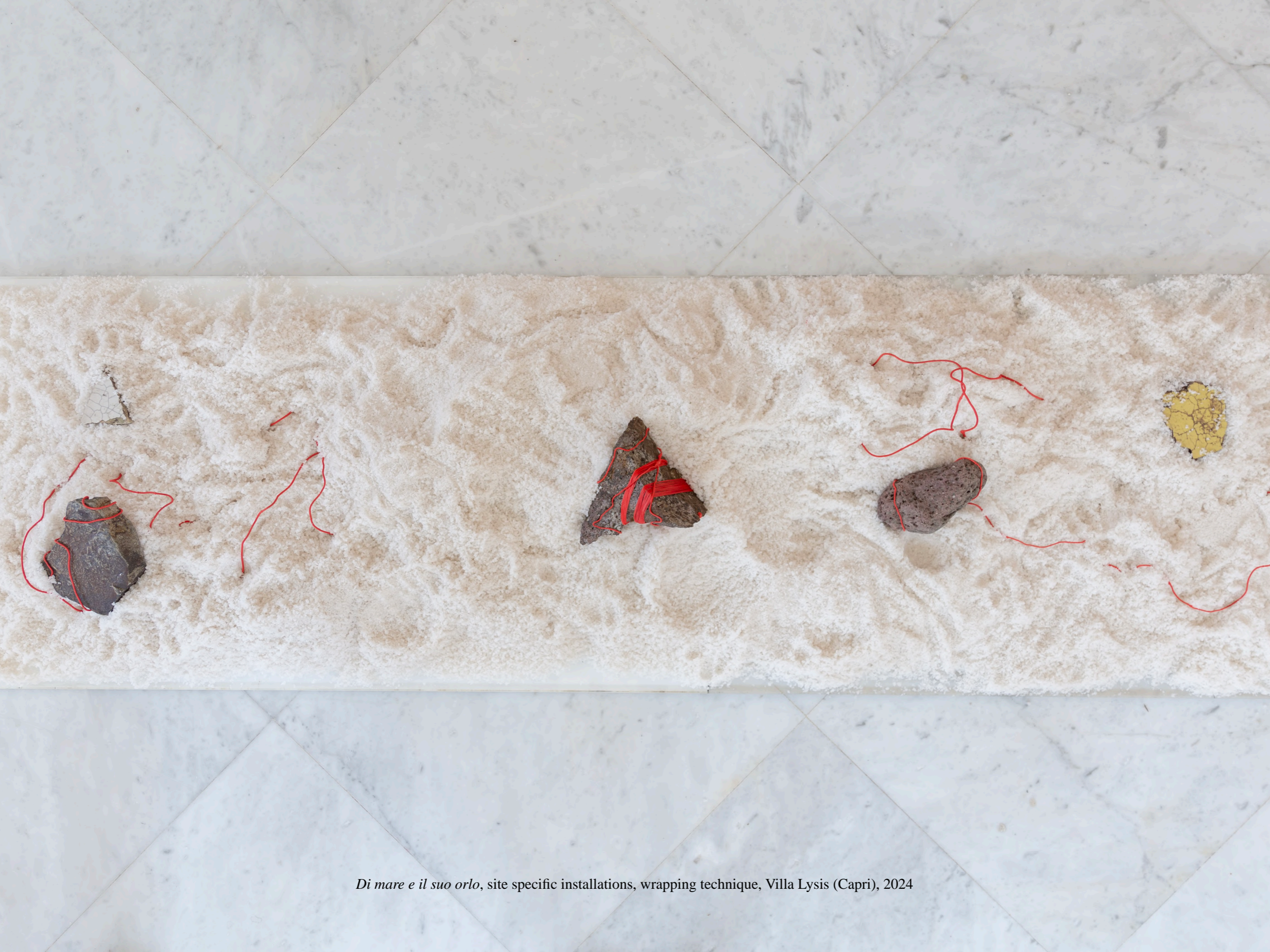
Di mare e il suo orlo , site specific installations, wrapping technique, Villa Lysis (Capri), 2024