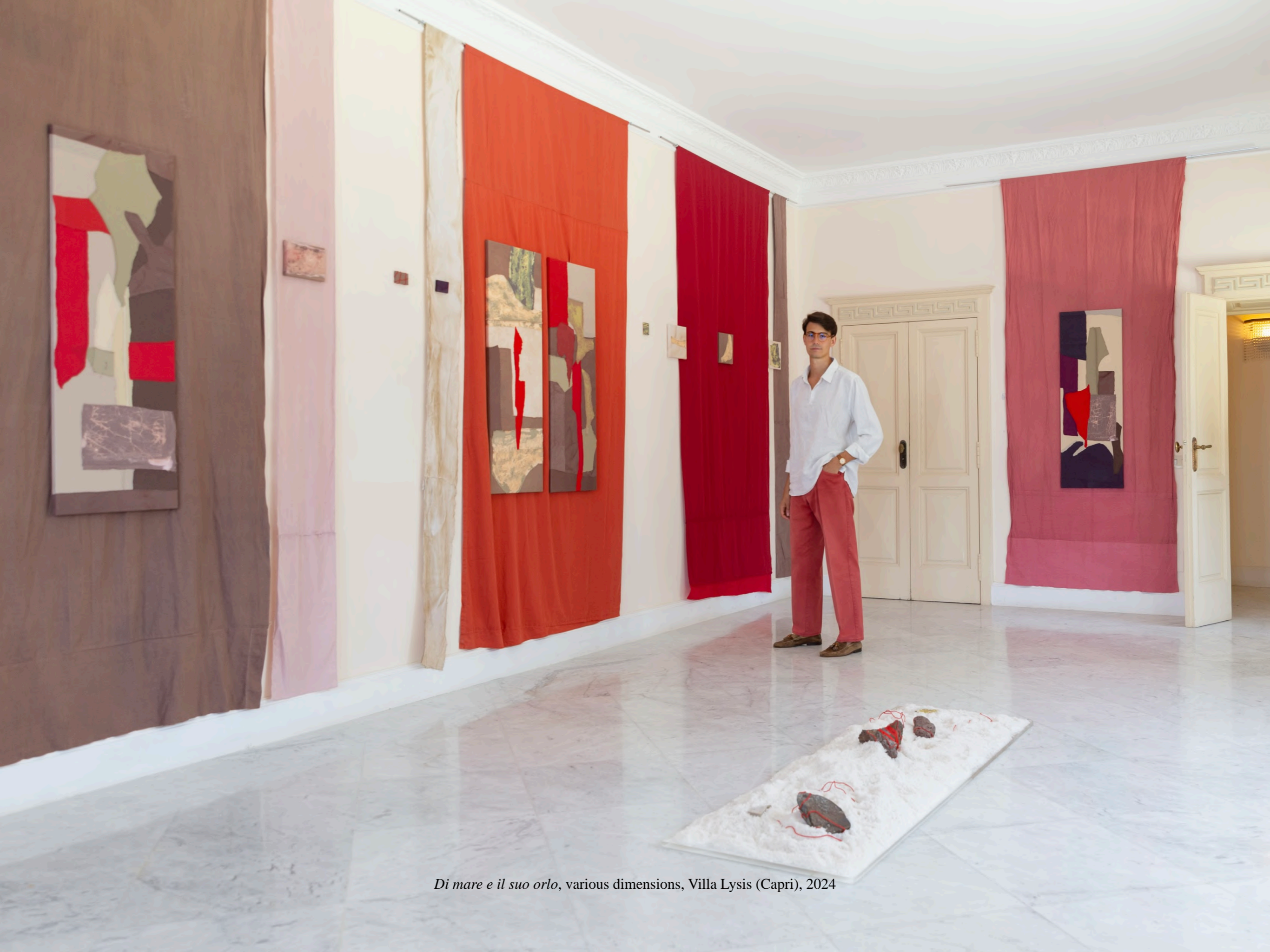
Di mare e il suo orlo, various dimensions, Villa Lysis (Capri), 2024