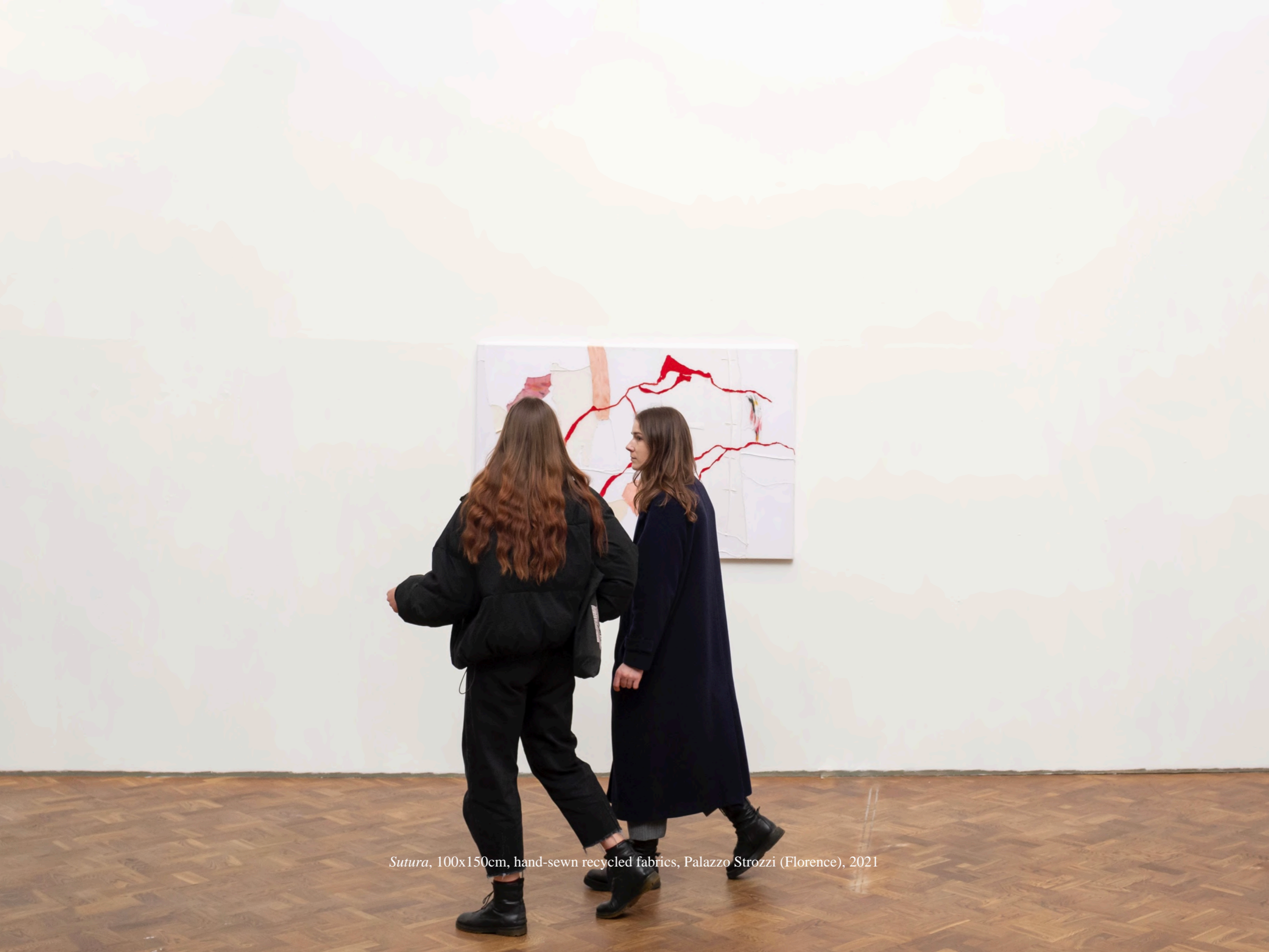
Sutura , 100x150cm, hand-sewn recycled fabrics, Palazzo Strozzi (Florence), 2021