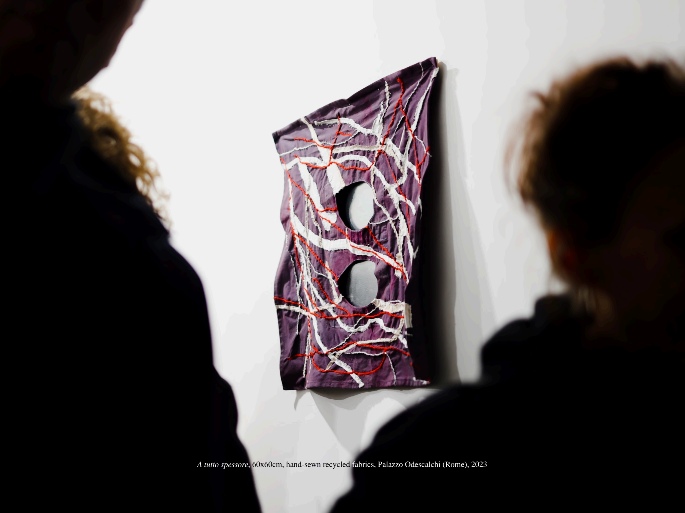
A tutto spessore , 60x60cm, hand-sewn recycled fabrics, Palazzo Odescalchi (Rome), 2023